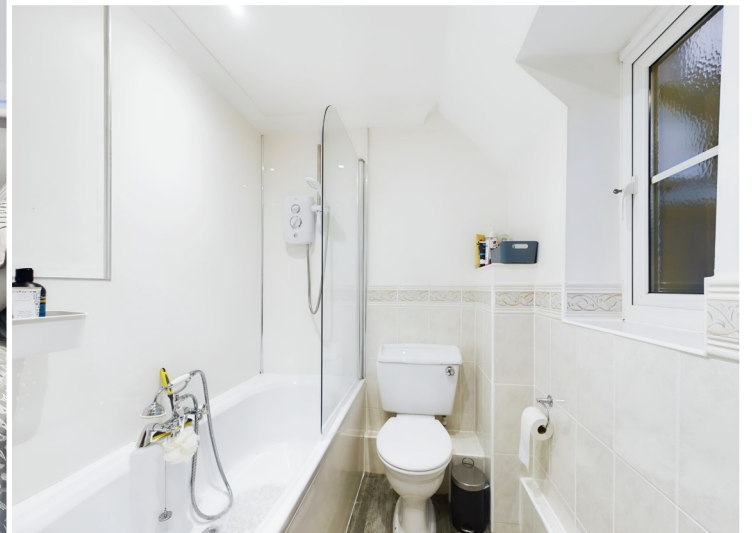
Bedrooms three and four are both double room with rear elevation windows looking over the garden. The family bathroom comprises a panel enclosed bath with an electric shower over, a wash hand basin and a WC.