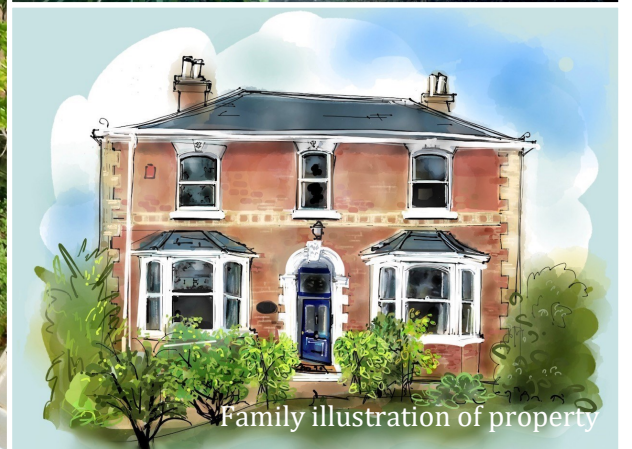
Family illustration of property