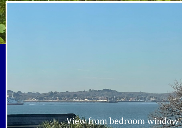
View from bedroom window

SUBSTANTIAL AND DOUBLE FRONTED, FOUR BEDROOM DETACHED CHARACTER PROPERTY, BUILT IN THE LATE 19TH CENTURY AND SITUATED IN THE HEART OF NETLEY ABBEY. OCCUPYING AN ENVIABLE PLOT AND OFFERING GLIMPSES OF SOUTHAMPTON WATER, THE DWELLING BOASTS LOVELY GARDENS, OFF-ROAD PARKING AND VARIOUS OUTBUILDINGS. VIEWING HIGHLY RECOMMENDED.